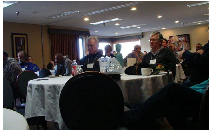
April Conference attendees getting the latest blasting information!