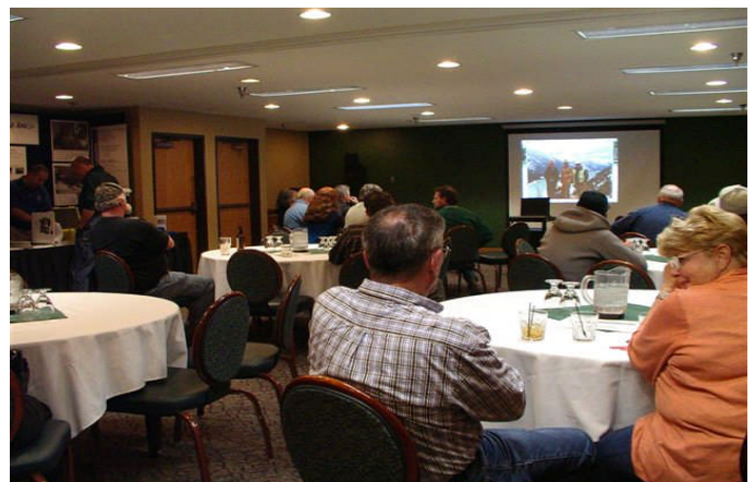
Crowd at the Friday night Video Round up and Reception