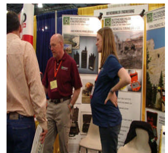
Rothenbuhler Engineering at the National Conference