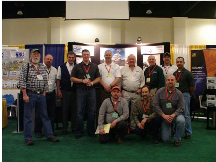
PNW Chapter Members participating at the National Conference!

Day 2 included the Blasters Training Seminar. Some of the presentations were, Blasting Liability and Safety, Blast Sensitization, Initiation Sequence Design, Benefits of Elec-